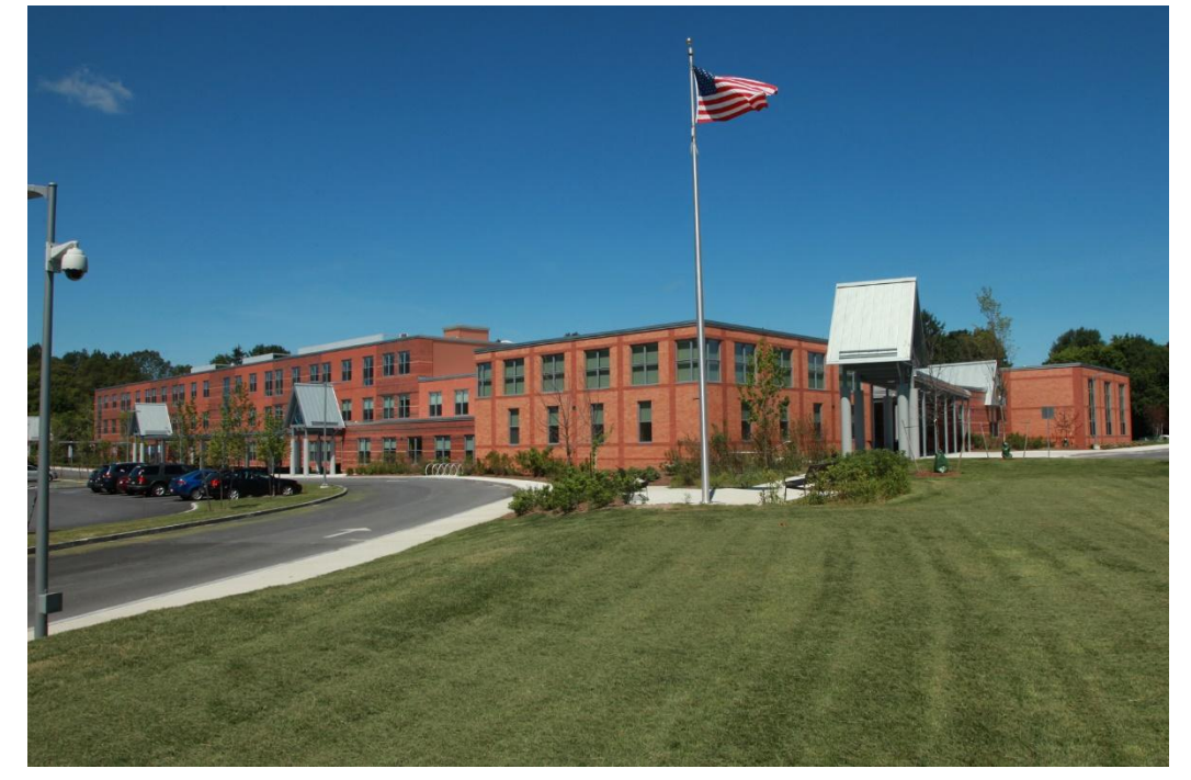
Francis T. Bresnahan School Preschool Information Night